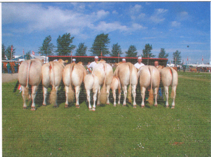
From the National show 2007

From the second to the fourth of July 2009, we will have our 25 th year's anniversary show in Herning. Herning is placed in the middle of Jutland, less than two ours driving from the border between Germany and Denmark