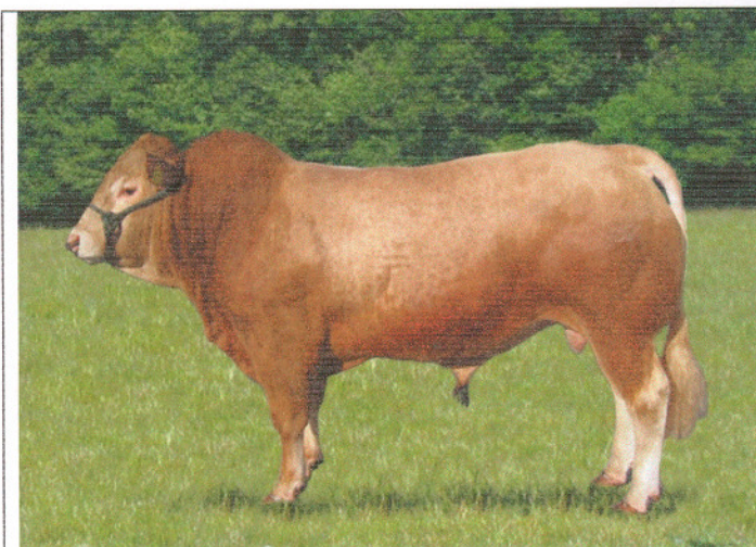
Cesar av Christinelund

As the first country in Europe, the organisation introduced the polled line in the nineteen's. To day we have the first homozygote bull in our line up of bulls, his name is Cesar av Christinelund and he is offered to all breeders in Denmark.